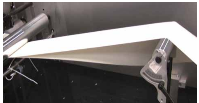
StreamFolder f20 — 3-up printing, Z-fold